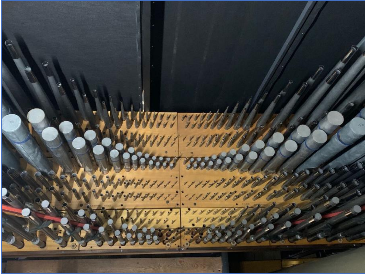
Positive Organ pipe ranks