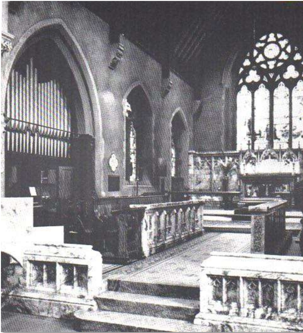
This interesting archive photograph shows the chancel and organ as they originally were. Note that the front pipes of the organ were then behind the arch. They were moved in front during the 1980s.